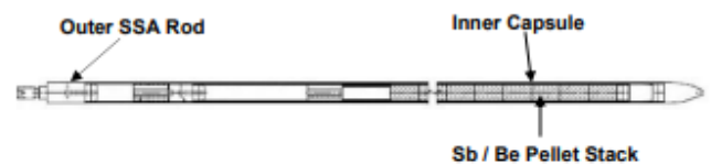
Double Encapsulated Secondary Source Rod

Externally, the double encapsulated Secondary Source Assembly design is dimensionally compatible with the earlier single encapsulated design. Internally, however, the double encapsulated design contains the Sb / Be pellets in an inner sealed and pre-pressurized capsule which is then positioned into the rod outer cladding. The axial positioning of the pellet stack is restrained by a pellet stack retention device. The source rod is also pre-pressurized after the lower and upper end plugs are welded in place.